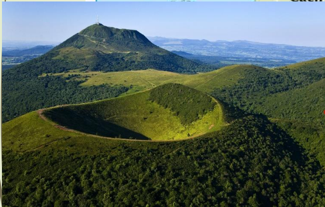
Auvergne – A volcanic area