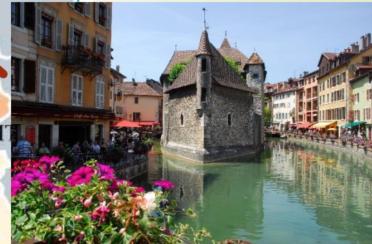
Annecy – The Venice of the Alps