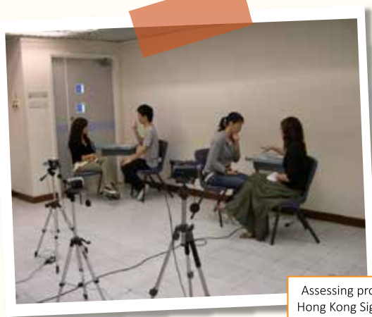
Assessing proficiency in Hong Kong Sign Language 香港手語測試