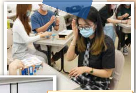
Training in Hong Kong Sign Language 香港手語培訓