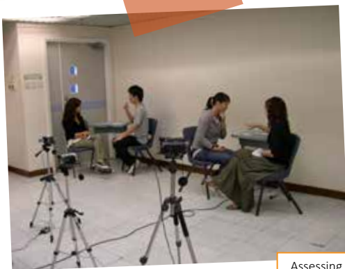
Assessing proficiency in Hong Kong Sign Language 香港手語測試