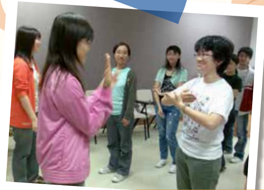
Training in Hong Kong Sign Language 香港手語培訓

The BA in Bimodal Bilingual Studies is a two-year top-up degree programme having the goal of eventually creating a workforce in society that is competent in spoken and sign languages for professional support in education in different settings, information accessibility in social and professional contexts, social welfare of disadvantaged groups, and many other domains that call for such a unique combination of linguistic skills. The first of its kind in Hong Kong and Asia, this interdisciplinary programme focuses on the study of language science from the perspective of bimodality – auditory/oral and visual/spatial – and bilingualism/multilingualism, and examines how such language knowledge may function effectively in professional settings.