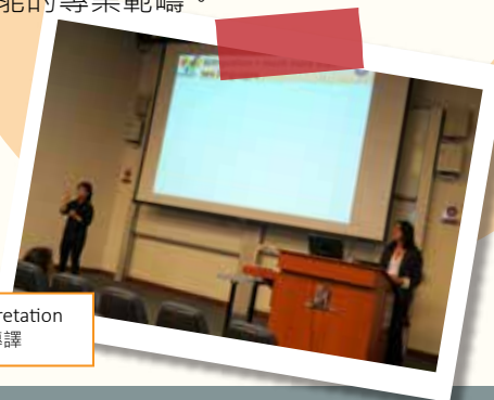
Sign Interpretation 手語傳譯